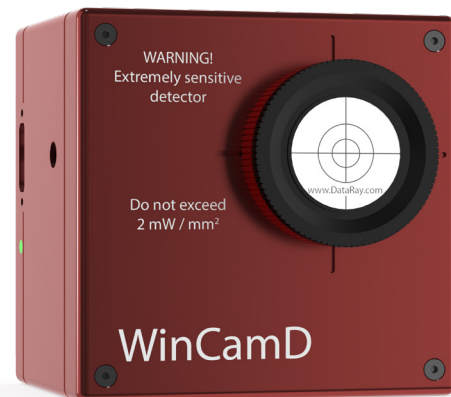
WinCamD-IR-BB 2.8 x 2.8 x 2.0"